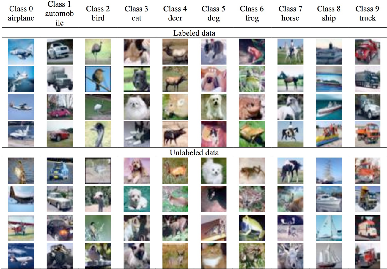
Figure 4. Some labeled and unlabeled images of CIFAR-10 after Stage 1.